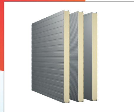
PIR sandwich panels (roof and façade)