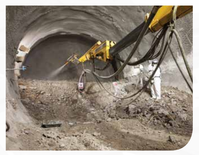
Shotcrete works at Crossrail, London