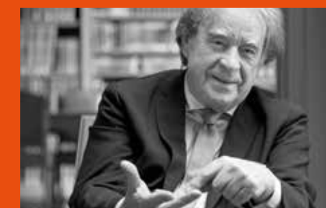
Jean-Michel Wilmotte Architect, urban planner, designer

We have developed systems of false acoustic ceilings that also provide heat and light, and a partitioning system that will highlight the presence of steel. All these elements of interior architecture are complementary to the external structure. The project will be a real technical laboratory for the possibilities of steel. It will be a journey of incredible discoveries. We are even looking for carpets made from braided steel wire, and we will seek to braid steel with other materials, and use cast steel and steel encased in glass.